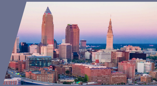
Exhibit Information for Sponsors

Exhibit Space: 6-foot tabletop display, two chairs